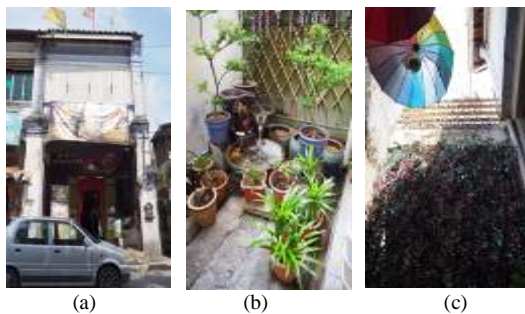
Figure 6. Façade and courtyard of Art of Dragon gallery