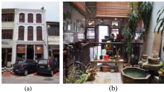
Figure 5. Façade and courtyard of Armenian house café

Armenian house café is categorised as the 'early straits' eclectic style shophouse that was built between 1890s-1920s. This shophouse was influenced by the European architecture style seen in the pilasters and other façade architectural details (figure 5a).