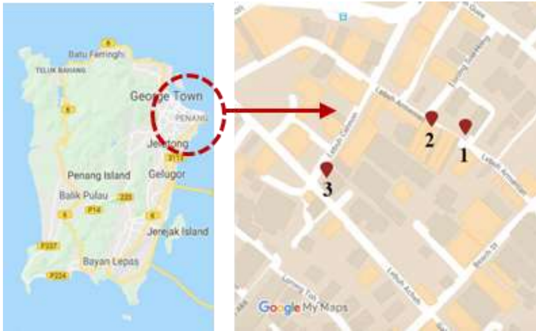
Figure 3. Location of the selected case studies