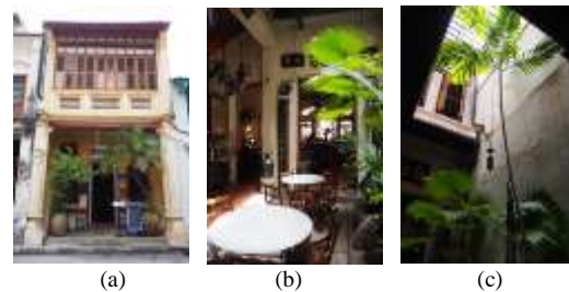
Figure 4. The façade and courtyard of Edelweiss café

Song, and Miyazaki 2017; Tsunetsugu, Miyazaki, and Sato 2007; Kelz, Grote, and Moser 2011).