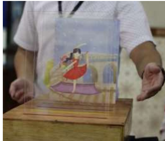
Figure 6. Surreal depiction created by layers of ordinary images (Project by Gracia and Santoso, 2019)

Some of the students' works demonstrate the importance of audiences in creating meanings for their design. When exhibited to the public, their works automatically asked anyone who approached them to make an interaction, enacting multiple interpretations of the story. Figure 6 illustrates one way to do it. Learning from the movie, La La Land , the pair let the viewer mix seemingly common elements like a dancer, carpet, train track, and a starry sky background into one scene to create a surreal atmosphere. A handful of images are also available so the audience can create their own story. The colour-coded slot in the wooden base has a mechanism in which people can only put one image at a time in an orderly fashion. This technique is deliberately applied to produce a sequence of having some ordinary images that gradually turn into a dreamlike scenery. The narrative is then created by the act of putting together out-of-place story elements.