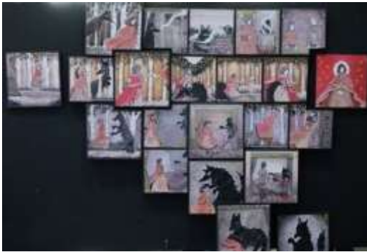
Figure 5. All-in-one Little Red Riding Hood (Project by Farhah and Pradani, 2019)

The two types of outputs demonstrate a process of narrative adaptation, either its story or the telling part. It also shows how an exploration of material expression could transfer the interiority of the narrative. By prototyping or making a mock-up, students explore the possibility to deliver a narrative that is distinct from its previous form. Figure 3, 4 and 5 convey the ambiguous aspect of stories. Being design works, they also open to different interpretation that enriches the meaning of the works.