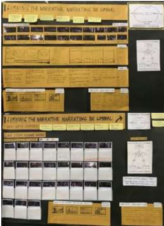
Figure 2. Many iterations of analysis to develop and communicate ideas (Project by Kumara and Reviara, 2019)

Estrangement technique was prominently perceivable in the analysis step of the project. The weekly presentation encourages the students to strip down their choice of narrative, distancing themselves with the end product of it. This inner process of defamiliarize the existing narrative shapes the project' final form. Figure 2 shows how it is done; the discussion between students and the facilitator create many iterations of analysis that lead to the project output's fresh ideas.