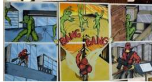
Figure 3. Space-time distortion in a graphic novel (Project by Aninditasari and Purba, 2019)

We found that the final outputs fall into two main categories. The first one is the adaptation of an existing narrative's structure to create new stories. Figure 3 corroborates this as the students learnt from graphic novels. They then expressed how space and time are warped in a graphic novel's panels and how the gap between the panels perform the narrative itself. From there, the students created a new story, consists of six panels that can be read from any starting point.