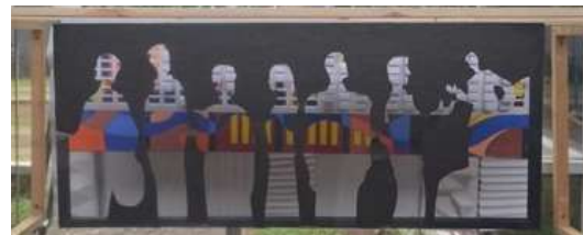
Figure 4. A new take on Donnie Darko (Project by Kumara and Reviara, 2019)

The second grouping is the one that represents an existing story with different narrative discourses. For example, figure 4 is the result of students' examination on every Donnie Darko's narrative elements. It shows the connection between layers of music, characters' gesture, and dialogue as a new representation of the movie.