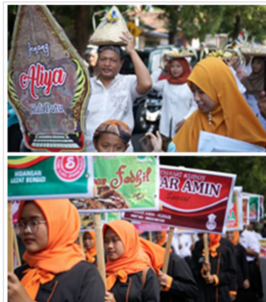
Figure 5. Social interaction during Kirab procession