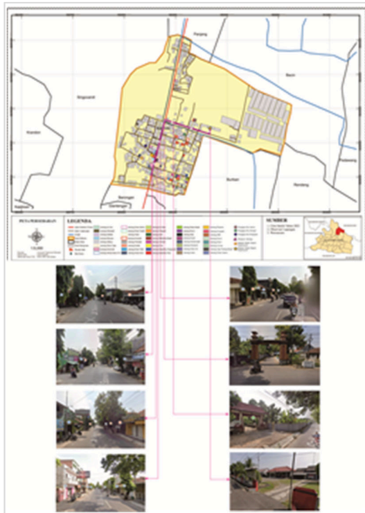
Figure 3. Corridor condition of Jl. Sosrokartono Gang 9