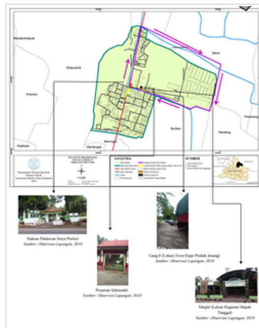
Figure 2. Parade route of the Jenang Tebokan (2006–2017)

only reflected the community's attachment to their lived environment but also created a more intimate atmosphere for the ritual procession.