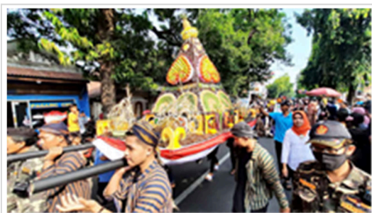
Figure 1. Gunungan Jenang Kudus in the Jenang Tebokan Parade

The Jenang Tebokan Parade is a traditional ceremony deeply embedded in Javanese cultural practices, particularly in Kaliputu Village, Kudus Regency. The event typically involves a procession ( kirab ) to commemorate important moments, featuring offerings such as the Gunungan Jenang Kudus .