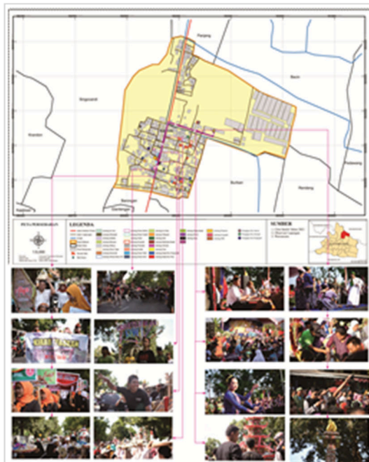
Figure 4. Corridor condition of Jl. Sosrokartono–Gang 9 during the Jenang Tebokan Parade (2018–present)