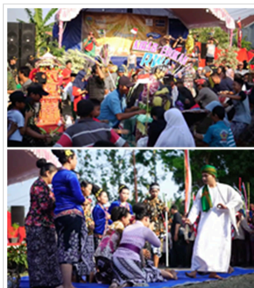
Figure 7. Social interaction during the kirab procession

values of prosperity, sustenance, and togetherness within the Kaliputu community. Beyond being a distinctive culinary offering, the jenang embodies spiritual significance, symbolizing gratitude for the agricultural harvest and the collective effort of the community in sustaining tradition. During the procession, the distribution of jenang to the public serves as a symbol of sharing blessings and reinforcing social bonds among villagers. Furthermore, the kirab route functions as a representation of the transformation of cultural space. Initially, the procession moved along narrower internal village lanes, evoking a more intimate and exclusive impression. However, with the change of route to the village's main road in 2018, the meaning of space in the procession underwent a significant transformation. The main road is no longer only a corridor of passage but also a wider and more inclusive cultural celebration space, accessible to a broader audience, including those from beyond Kaliputu Village.