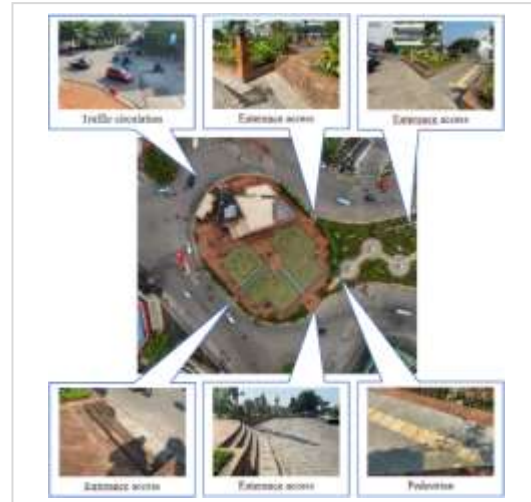
Figure 10. Pedestrian paths in Bubakan Roundabout, Semarang

However, due to the revitalization program held in Semarang Old City, tourists from Old City can conveniently work at the museum (Mamuaja, Rompis, and Timboeleng 2018). This is a good influence on people's behavior because not many people walked around the roundabout before it was revitalized but now people are interested in walking in this area, of course to take a walk in the Semarang Old City Museum area.