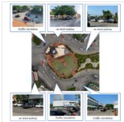
Figure 9. Circulation and parking in Bubakan Roundabout, Semarang

should be passable in one lap. The circulation system is supposed to consider the functional, economic, flexible and convenient aspects of connecting different activities in an area. In addition, there is a parking space where vehicles can park for a long period or just for transit. Sandal parking is divided into on and off streets. The process whereby a large number of vehicles are parked in the shopping and office areas around the roundabout is known as on-street parking. This greatly affects the people circulation, especially with vehicles because those parked on the side of the road tend to obstruct traffic flow at the roundabout (Utami 2018; Ginting and Sejahtera 2019) People get confused and have to adjust to the new circulation flow, so this indeed affects people's behavior passing by on the roundabout.