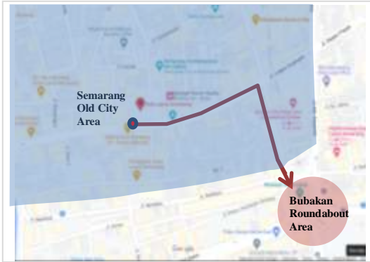
Figure 4. Location map of Bubakan Roundabout near to Semarang Old City

historical artifacts were also discovered in the area. This is behind the restoration and utilization of Bubakan park as a museum. According to the Deputy Mayor of Semarang, it is intended to be used to display artifacts found in the roundabout.