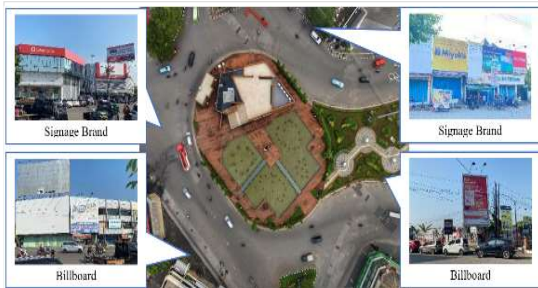
Figure 13. Signage in Bubakan Roundabout, Semarang

middle of the roundabout was an Old City Museum, filled with signs showing the names of the innumerable stores and offices. This makes the visuals around this area more crowded and varied (Wijayanti 2019). There is no significant people's behavior in response to signage elements in this area, as this is a common sight in urban environments.