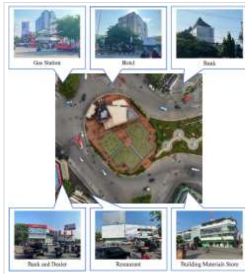
Figure 7. Land use in Bubakan Roundabout, Semarang

electrical equipment and building materials, including restaurants, hotels, banks, and gas stations. Presently, there have been no significant changes in its layout, rather the once passive park was converted into a museum. This is due to two factors firstly, the relevance to meet the needs of the increasing population, and secondly, the increasing demand for quality life (Yusoff 2020). Likewise, people's behavior does not change or feel uncomfortable because the physical buildings around them have not changed much either.