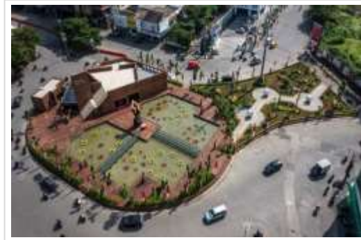
Figure 2. Condition of the Old City Museum in 2022

Based on these phenomena, this study aimed to analyze the influence of the Old City Museum as a landmark in Bubakan City towards the urban spatial surrounding and also people's behavior who cross over the roundabout. It is important to evaluate its advantages and disadvantages, as well as external opportunities and threats. This aids in analyzing the necessary steps that can be adopted to optimize the surrounding environment related to urban designs, such as visuals, integration between elements, and the support of related parties. Thus, we will understand that the existence of new landmarks will raise new challenges in urban spatial planning, in terms of visuals, integration between elements, as well as support/obstacles from related parties. A diagrammatic representation of the flowchart is shown below (figure 3).