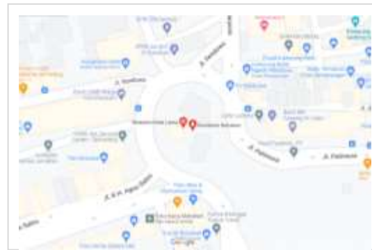
Figure 6. Location map of Bubakan Roundabout (Now Old City Museum)

Presently, the Old City Museum is a new landmark in Bubakan Roundabout. This structure has a dominating formula singularity in the surrounding environment. Its contrasting and unique shape gives it a prominent appearance, contextual or background representation of the building, strategic place, meaningful sequences, and specific details that make it more exclusive. Figure 5 shows that this museum is magnificent and boosts the image of the park that was once abandoned, now it is more useful because it is visited by innumerable visitors (Lynch 1964). Despite this, the environment is still similar to when the museum was still a park.