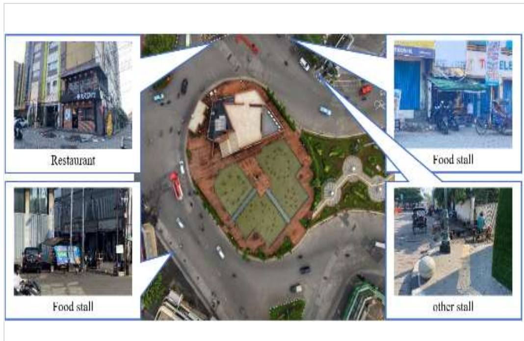
Figure 12. Supporting activities in Bubakan Roundabout, Semarang

City Museum continue to grow because it has become a tourist destination ( Putra 2020 ). Not many people are interested in supporting activities such as food stalls around the roundabout because the stall conditions are not suitable for tourists, but for the local community, this has become a common sight.