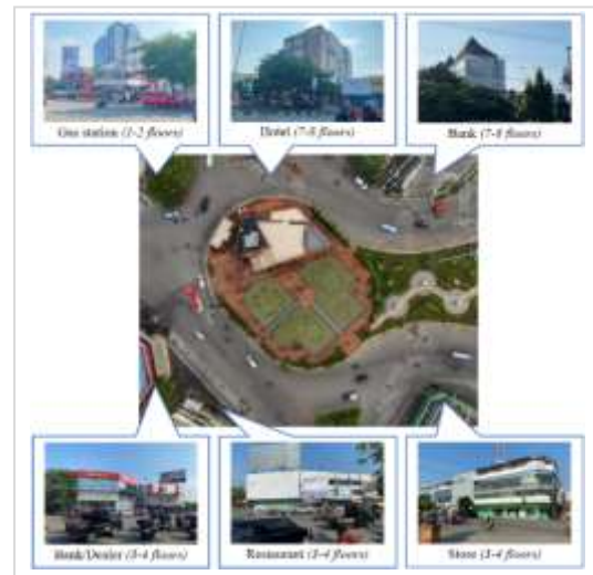
Figure 8. The shape and mass of buildings in Bubakan Roundabout, Semarang

shape and building mass concern aspects of the physical form. The goal is to achieve a balanced, proportional, harmonious, humane-scale mass state by taking into account the contextualization of the surrounding building (Rahmawati, Laksono, and Laksmiyanti 2021). Likewise, the forms of these buildings also do not significantly affect people's behavior because there are no buildings that are significantly different from the others that can distract the views of people passing through the roundabout. People's views have been confiscated because the shape of the museum building is visually different from other buildings in the vicinity.