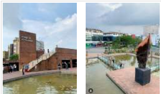
Figure 5. Activities at the Old City Museum

Presently, Taman Bubakan has been restored and revitalized into the Old City Museum. Although, the lack of green open space makes it look contrasting. Previously Bubakan Garden contained plant elements and water, and as a green open space, the park is quite effective in terms of neutralizing the polluted air circulation. Residents of the city need green open space because of its beneficiary functions, such as a protection area, means of observing a clean, healthy, harmonious and beautiful environment, to improve the microclimate as well as the regulation of water and urban systems. It was eventually restored for the museum to be built. Although the initial plan was to create a polder (flood control system) and park for the community, because it was discovered to be a historical site, the government decided to erect a museum (Widjajanti 2013; Fatubun 2018).