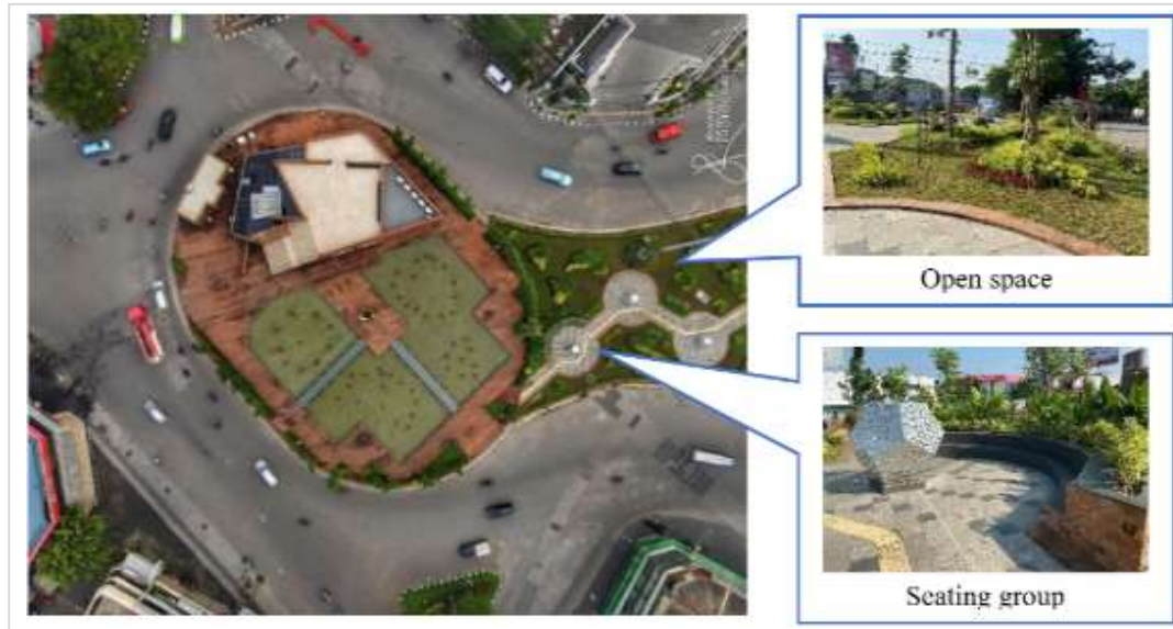
Figure 11. Open space in Bubakan Roundabout, Semarang