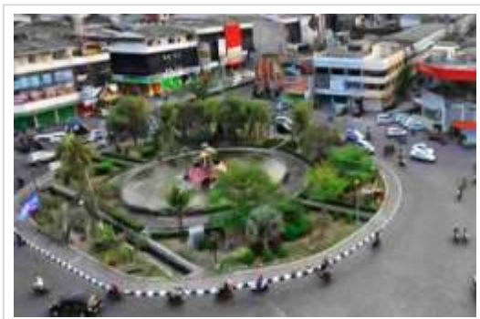
Figure 1. Bubakan Roundabout condition before the 2018 revitalization

The impact of this development is that the circulation flow of vehicles became denser. This should have been smoother because there are no detours, which makes the roundabout congested with immovable vehicles. Furthermore, the building used by tourists needs access to the museum, which is still unavailable. Tourists were also forced to park their vehicles in the Old City area, approximately 1 km away. Only a few tourists were willing to walk towards the museum after parking their vehicles on the shoulder of the road or in front of shops. This is detrimental to shop owners and road users who usually use the roundabout. From this problem, researchers assume that the presence of a new landmark at the Bubakan roundabout will change the urban spatial order, as can be seen from the spaces around the Bubakan area having to change function into new spaces, resulting in degradation between one space and another. Besides, the roundabout became even hotter due to a lack of greenery, unlike in the past when it was filled with trees, as shown in figures 1 and 2.