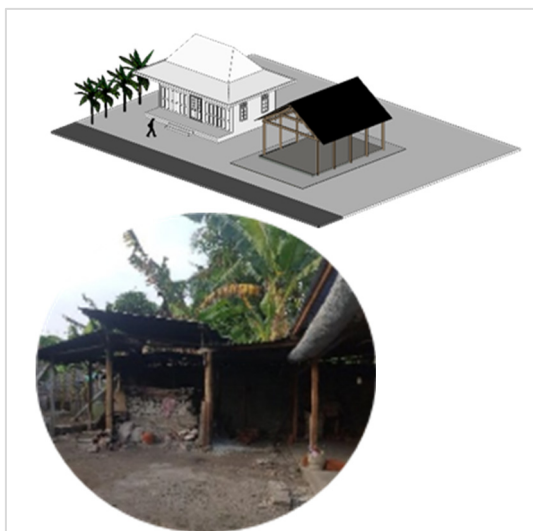
Figure 3. Typology of traditional houses with a simple production workshop

The interpretation of the building layer shown in figure 2 indicates that the 1960s and 1970s were concentrated on the southern side, close to the Kyai Song Tomb, and on the western by the Bedog River flow. Residential functions and purposes dominate the typology of the building with various local roofs, srotongan, limasan shields, and comedy pyramids. In figure 3, the main buildings are generally situated in the middle with relatively large open spaces and no physical fences. There are several production areas adjacent to the main residential building with various grilled roofs and village gables. The development tends to be moving from the south to the northern part, irrespective of whether these two decades were not the most dynamic era during the Kasongan morphological period.