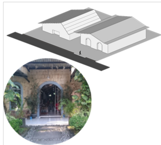
Figure 7. Typology of galleries

In the early periods, one thing that continued was the exhibition of pottery or ceramic products in the front area or as part of the building's facade in the shop. The relatively visible difference is based on the fact that the variety of goods produced in the newly emerging shops or galleries is no longer dominated by pottery or ceramics, rather it includes the production of natural stone, rattan, water hyacinth, and wood. This is the distinguishing character of the area on the eastern side of the river, which is more diverse than the western part. Apart from these shops, there is a gallery belonging to artists, some of which are regularly used for exhibitions, as shown in figure 7 . For example, one of them is Timboel Art Gallery, owned by Timbul Raharjo. Initially, it was a craft shop that was later transformed into a gallery after the 2006 earthquake.