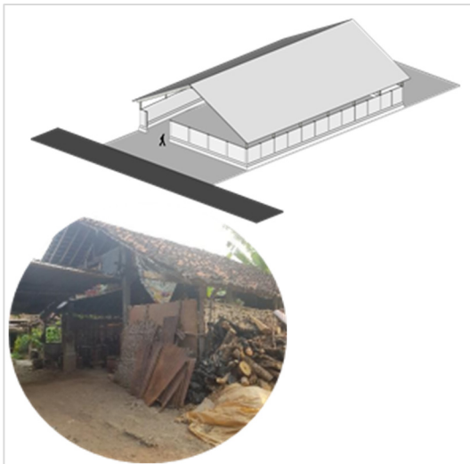
Figure 11. Void elements (gardens) that have turned into solid elements (storage)

The Kasongan area, originally characterized as an agrarian village landscape, is presently more inclined toward a handicraft industrial village landscape. In the pottery production context, the burning process, which had gradually changed since the 80s from field to open-pit stoves (tobong), has also caused the area's atmosphere to be more heavily concentrated in mass than in open spaces. The direction of mass consolidation, which was initially concentrated around the Bedog River regarded as a source of water and pottery craft materials, gradually seemed to fill the district roads, which had the highest hierarchy.