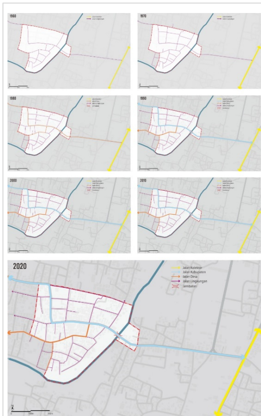
Figure 8. Mapping of road development in Kasongan

The mapping shown in figure 8 depicts that in the 1960s, there were only local roads within the Kasongan area that tended to be introverted. This community, the capital city of Bantul Regency, and the provincial capital of Yogyakarta are separated by the Bedog River. The only link is a bamboo bridge that is only accessible to pedestrians and two-wheeled vehicles, which were independently built in 1955. The connection was improved by constructing a more permanent concrete bridge in 1974 and renewed again in 2003 with a wider one.