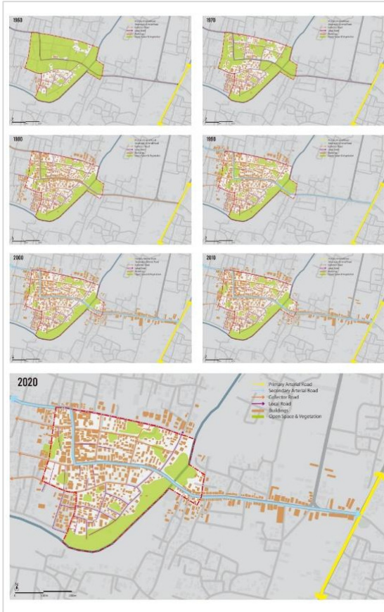
Figure 10. Mapping the development of solid-void elements in Kasongan