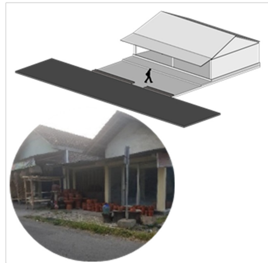
Figure 9. Road in front of a row of shops that have been equipped with sidewalks

Raharjo (2012) stated that it had the ability to bear heavier loads. At the beginning of the observation period, the roads in Kasongan were mostly dirty until it was cemented with clay fragments and pavements on the edge of the main road in 1985.