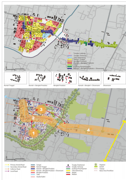
Figure 1. The ground figure and a chronological stage map of the typology distribution

It was reported that in 2021, Kasongan will be developed into a pottery and handicrafts center on