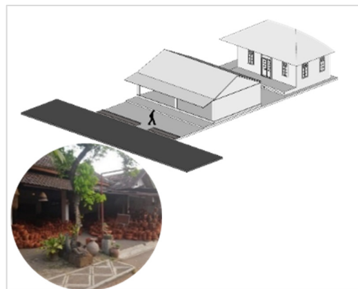
Figure 4. Initial typology of mixed pottery shop with residential houses

The 80s was marked by the emergence of mixed housing with production workshops and shops, as shown in figure 4. This is in addition to the increasing demand for Kasongan ceramics industry. Based on the spatial arrangement, the dwelling is generally situated at the inner part of the site, while the production workshop is on the side, and the shop in front of the house and also serves as a transition between the dwelling and the production workshop.