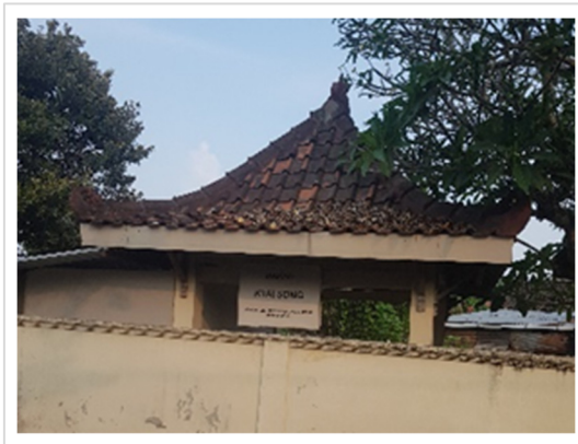
Figure 13. Kyai Song's Tomb

Green open spaces in rice fields and gardens are gradually decreasing. The remaining ones are tombs, road spaces, private courtyards, and the Bedog River, whose public access is relatively closed. The open space in Kyai Song's tomb area is quite persistent. It is irreplaceable by other functions, especially those related to its cult as an elder of the Kasongan, as shown in figure 13 Region ( Raharjo 2012 ).