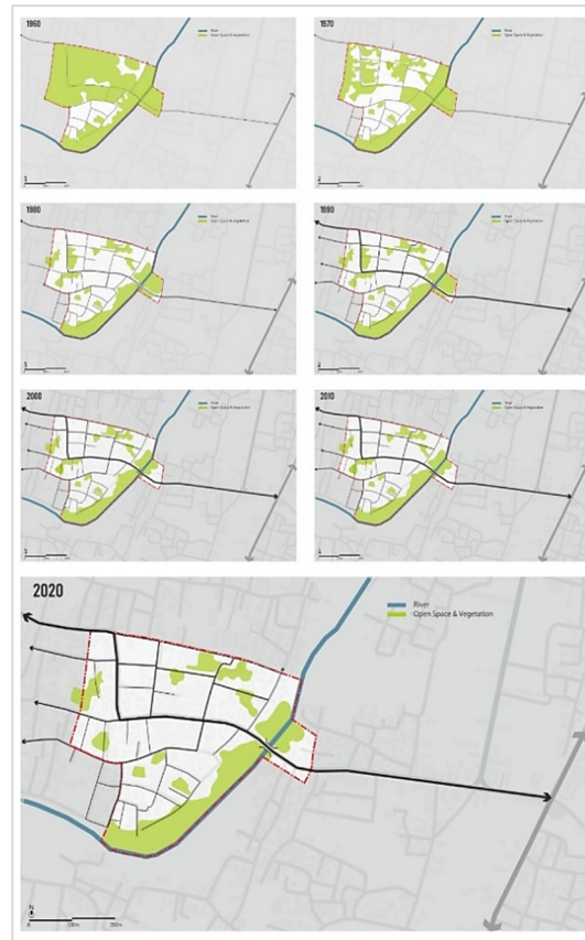
Figure 12. Mapping of the natural context development in Kasongan

The Kasongan area, originally characterized as an agrarian village landscape, is presently more inclined toward a handicraft industrial village landscape. In the pottery production context, the burning process, which had gradually changed since the 80s from field to open-pit stoves (tobong), has also caused the area's atmosphere to be more heavily concentrated in mass than in open spaces. The direction of mass consolidation, which was initially concentrated around the Bedog River regarded as a source of water and pottery craft materials, gradually seemed to fill the district roads, which had the highest hierarchy.