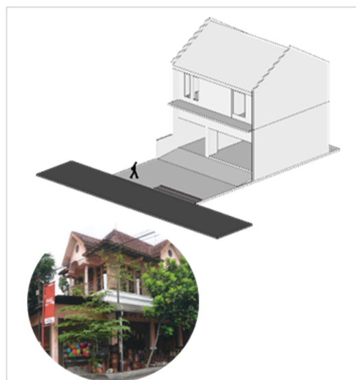
Figure 5. Current typology, the mix of shops and houses

In the early 90s, there were indications of several changes in the building materials and construction process. The use of bamboo and wood was gradually replaced with bricks and concrete. The building, originally erected on the ground, was vertically raised to the second and third floors, as shown in figure 5. In the 80s and 90s, various styles emerged with a flat roof model and a popular concrete molding for the typology of residential houses on the island of Java. Industrial-driven functions such as the Technical Implementation Unit were developed (Department of Industry and Trade of Yogyakarta Province). It is perceived as an agent of change in production technology.