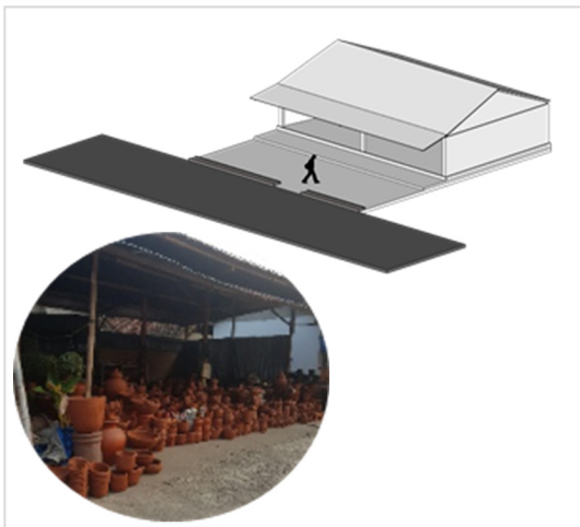
Figure 6. Typology of single building shops

The small and medium-sized single-store typology was dominated by simple and functional architectural designs or forms. The roof shape was made from various local materials such as clay tile covering, fiber cement, or zinc, as shown in figure 6 . The single shop building seems to dominate the collector road connecting Bantul Street to Bangunjiwo Village.